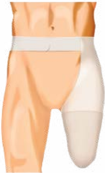
U.S. Patent No. 7,575,561

Now available with facility logo! See pg. 55!